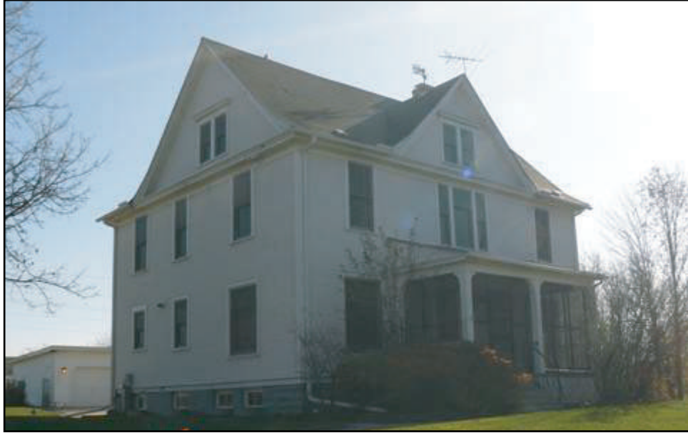
Figure 2. Overview of Building 37