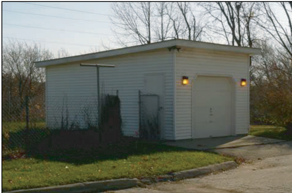
Figure 3. Overview of Building 93